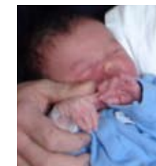
Home Away From Home Page 2