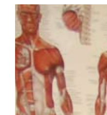
Convenience of Physical Therapy Page 4