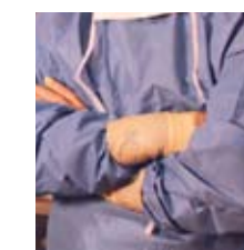
Outstanding Surgical Care Page 3